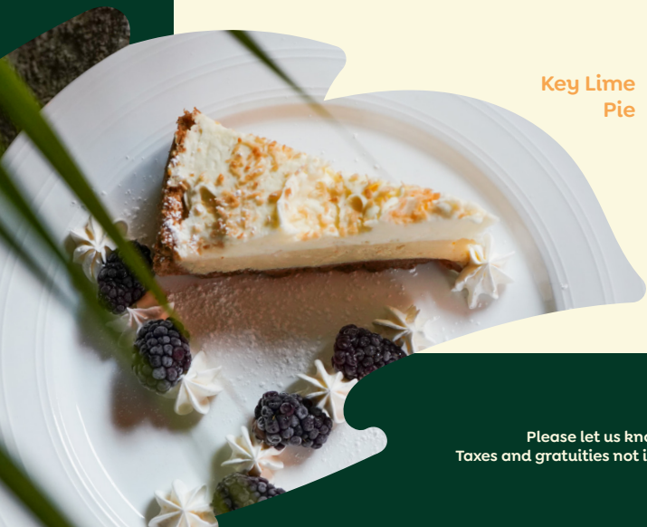
Key Lime Pie

Lungo espresso, Baileys, chantilly cream, chocolate